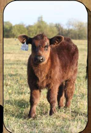
Bart sired heifer calves from Angus and Chi/Maine Cows. Thick and deep bodied babies.